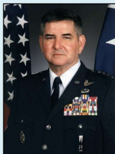
General Ronald R. Fogleman, 15th Chief of Staff, United States Air Force

The other Services have air arms—magnificent air arms—but their air arms must fit within their Services, each with a fundamentally different focus. So those air arms, when in competition with the primary focus of their Services, will often end up on the short end, where the priorities for resources may lead to shortfalls or decisions that are suboptimum. It is therefore important to understand that the core competencies of [airpower] are optional for the other Services. They can elect to play or not play in that arena. But if the nation is to remain capable and competent in air and space [sic], someone must pay attention across the whole spectrum; that is why there is a US Air Force.