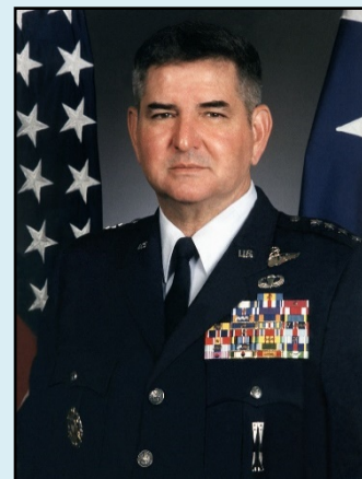
General Ronald R. Fogleman, 15th Chief of Staff, United States Air Force

The other Services have air arms—magnificent air arms—but their air arms must fit within their Services, each with a fundamentally different focus. So those air arms, when in competition with the primary focus of their Services, will often end up on the short end, where the priorities for resources may lead to shortfalls or decisions that are suboptimum. It is therefore important to understand that the core competencies of [airpower] are optional for the other Services. They can elect to play or not play in that arena. But if the nation is to remain capable and competent in air and space [sic], someone must pay attention across the whole spectrum; that is why there is a US Air Force.