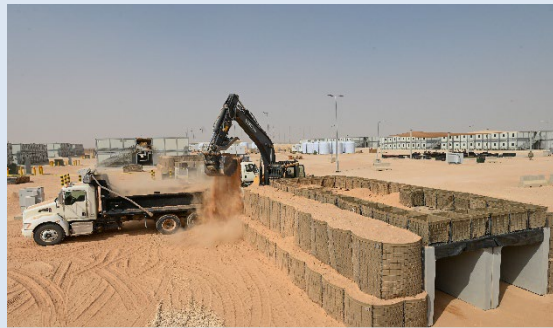
Air Force Civil Engineers build bunkers at an undisclosed location in Southwest Asia.

USAF engineering capability consists of engineers' activities to open, establish, operate, sustain, protect, recover, and close bases. It can operate at any level of global competition through ACE. It focuses on operating and maintaining aircraft arresting systems, airfield lighting, heavy equipment, airfield surfaces, roads, and temporary, semi-permanent, or permanent facilities, and includes specialized capabilities in power generation and distribution systems. Teams perform horizontal and vertical construction, provide pest management and environmental services, provide overall installation development planning, design, and contract support, including specialized augmentation at echelons above wing level. Engineers also conduct base response and recovery to facilities, infrastructure systems, and airfield damage. In contested environments, engineers' ability to execute recovery and hardening activities directly contributes to countering adversary kill chains. Engineers can move around the operational area using air or ground transportation. Engineers are fully weapons qualified and can provide work-party security and participate in integrated base defense.