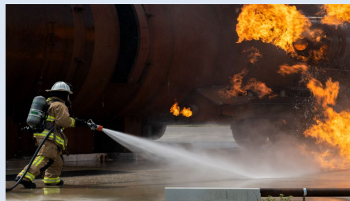
156 th Civil Engineer Squadron member practices extinguishing a fire at Aviano Air Base, Italy.