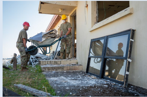
Air Force Civil Engineers conduct demolition at Lajes Field, Portugal.