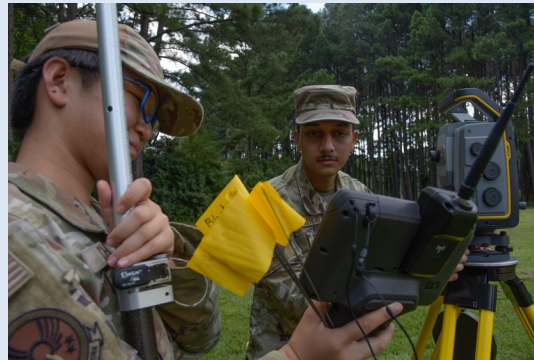
Civil engineers from the 4th Civil Engineer Squadron collect and use geospatial data.

Geospatial engineering supports operational needs through reconnaissance, including terrain, airfield, and site surveys, to assist the air component commander's decision cycle on general engineering efforts. Engineers can assist in the predictive analysis of terrain and weather system effects during planning and construction. Geospatial engineering personnel evaluate potential construction sites and perform field tests on soils, asphalt, and concrete.