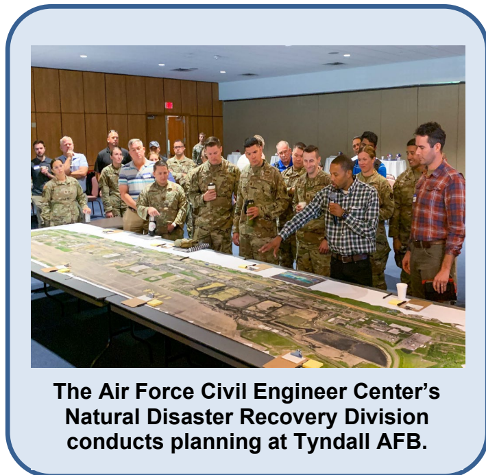
The Air Force Civil Engineer Center's Natural Disaster Recovery Division conducts planning at Tyndall AFB.

Engineers undergo specialized training to respond to, recover from, and reconstitute installations. This training encompasses basic medical procedures, casualty collection, closing gas valves, isolating electrical breakers, and other essential skills. Furthermore, each unit identifies and trains Airmen as cohesive teams to conduct post-attack reconnaissance in their areas of responsibility. These proficient teams are the eyes and ears of C2 after an attack or event, supplying invaluable information to determine an appropriate response. Through collaborative efforts, engineers spearhead IBRR initiatives for an installation, working with other units,