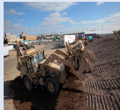
New Jersey Air National Guard Engineers assist civilian authorities in Hurricane Sandy cleanup.

Additionally, engineers support joint task forces with DSCA in the immediate aftermath of natural or man-made disasters. When military support to civilian operations is approved, engineers assist federal, state, and local emergency response agencies. Engineers support the Federal Emergency Management Agency (FEMA) by providing beddown support as an incident support base or when the DoW establishes a base support installation, helping recover communities and missions as needed.