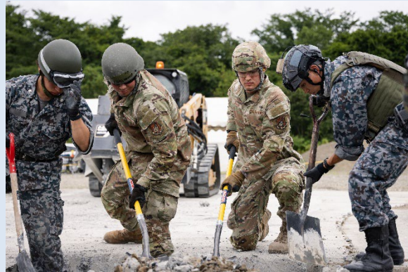
Misawa Air Base, Japan: 35th Civil Engineer Squadron and Japanese Air Self-Defense Force partners execute Rapid Airfield Damage Repair operations during Resolute Force Pacific 2025.

Engineer functions can be grouped into key areas: general engineering, geospatial engineering, and installation support and services. When combined, these functions enhance the readiness and status information for PPPs, enabling the air component commander and JFC to make informed decisions on the use of airpower capabilities across the competition continuum. In effect, this information is a critical engineering function that enables the USAF to operate from the PPP capabilities engineers provide. With the emerging potential of contested environments at main operating bases, engineers are prepared to employ in place to support joint all-domain operations at home station.